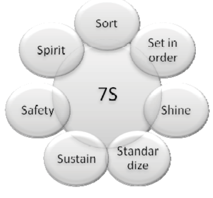
Figure 3 Phases of 7S

Each phase continuously improves the performance of an organization by eliminating wastages of searching, waiting, transportation, motion, work in progress inventory etc. 7S also makes the working environment clean and safe that improves the morale of the employees. The improvement in the form of the morale is a qualitative form that is responsible for the reduction in the Manufacturing Lead Time (MLT). So, the 7S helps to reduce MLT in quantitative form as well as in qualitative form. The quantifiable variables are searching, move, waiting time, cycle time, lead time, production rate, productivity, quality, profit and client network and the qualitative variables are working environment, communication and morale.